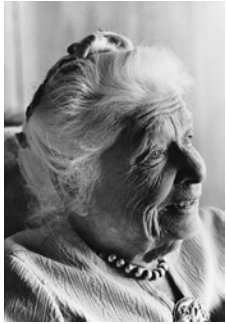
Dr. Ida P. Rolf

Rolfing is a holistic system of soft tissue manipulation that corrects structural imbalances in the body by realigning the connective tissue network. This method was conceived by Dr. Ida P. Rolf more than fifty years ago and is increasingly recognized by medical and veterinary professionals as having the ability to increase longevity in athletes, both equine and human.